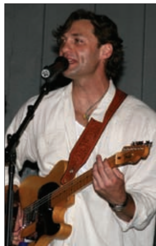
Country music star Wade Hayes is the lead guitar player and sings back up in Randy's band. Wade sang a few songs during the event.