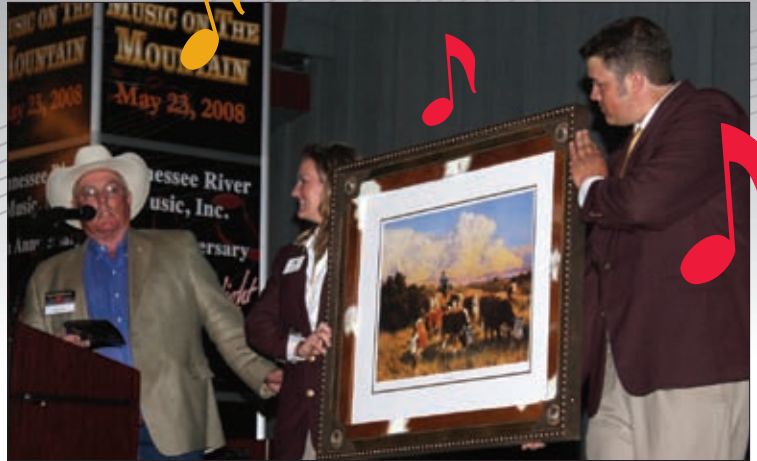
The live and silent auction raised $86,300 to support Hereford youth. Highlights of the auction included numerous paintings, hunting trips, special bottles of wine and much more.

grossed $200,000 for the Hereford Youth Foundation of America (HYFA).