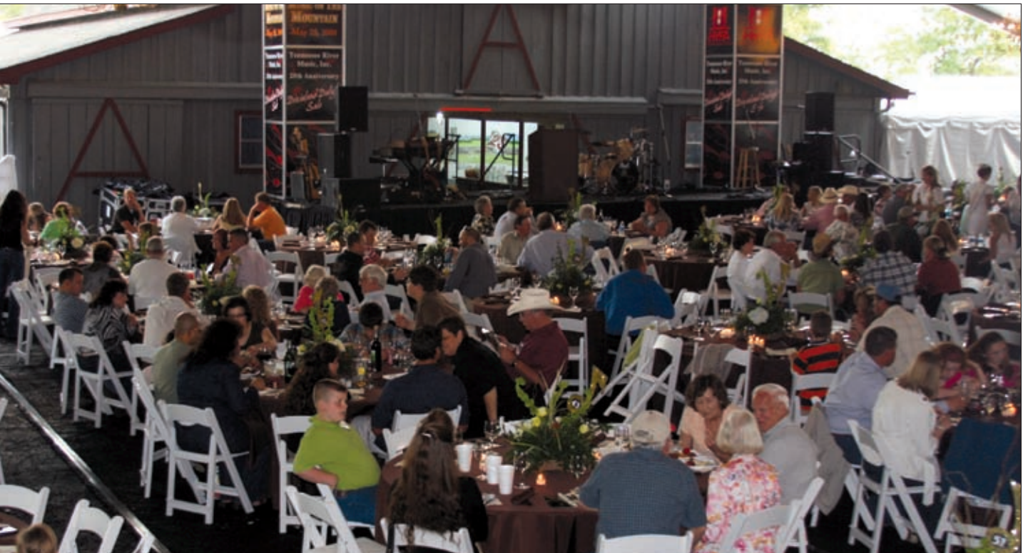
More than 560 Hereford enthusiasts made their way up the mountain to attend the HYFA fund-raiser celebrating Tennessee River Music's 25th annual sale.