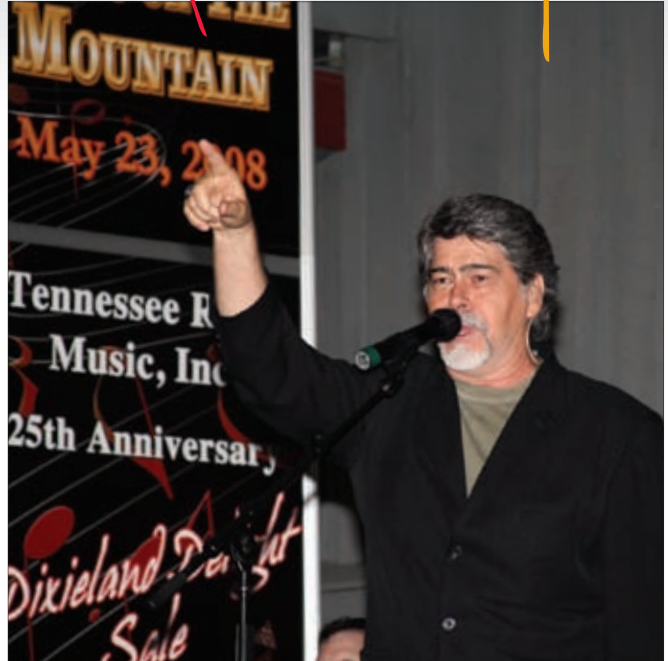
Hereford breeder and country music star Randy Owen entertained 560 Hereford enthusiasts.

The exciting evening included live entertainment headlining Randy Owen and the Nashville Star Band as well as a meal and silent and live auctions. The evening