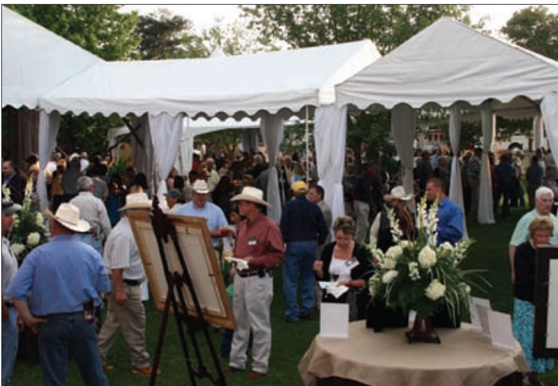
The silent auction featured jewelry and specially bottled and numbered wine from the Kunde Estate Winery and Vineyard, Kenwood, Calif.