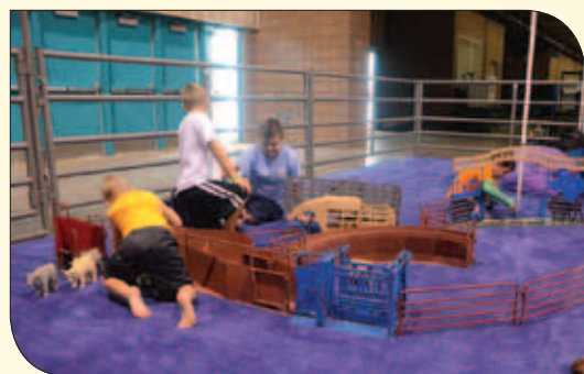
Young JNHE attendees were able to "work cattle" and enjoy movies — giving parents an often needed break — in the kids' corner of the showing throughout the week.