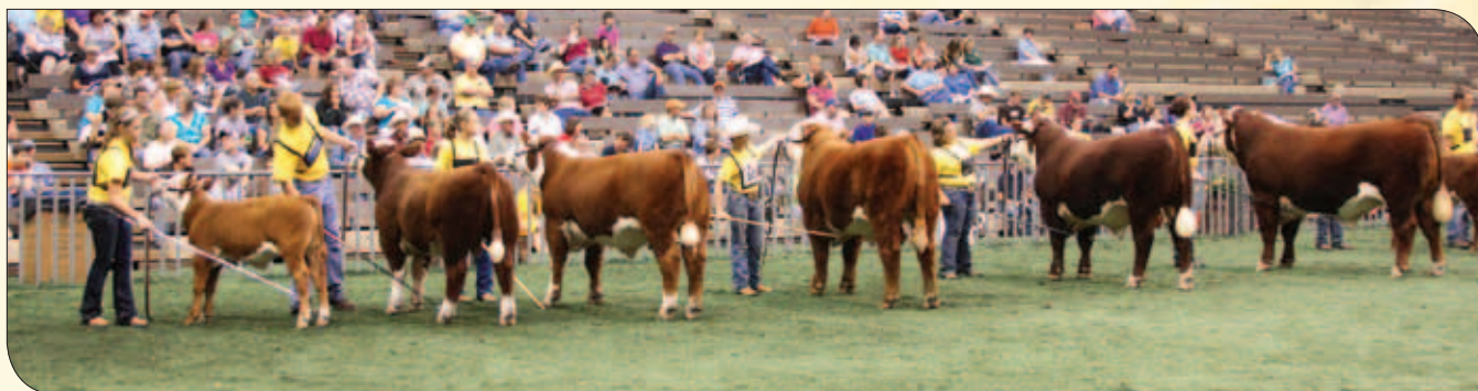
Division champion bulls vying for grand champion bull title.