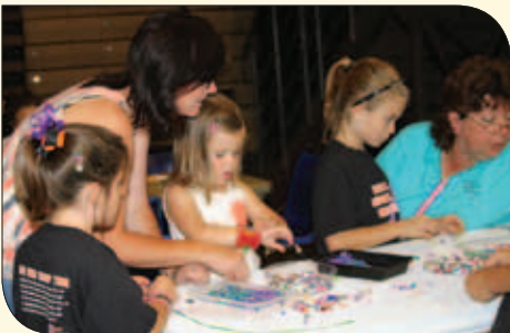
On Tuesday afternoon, the National Hereford Women provided an ice cream social for participants and their families. During this event, youth were also given the opportunity to create one-of-a-kind bracelets and necklaces.