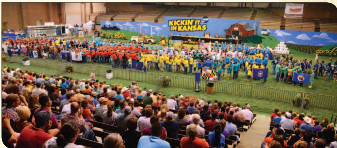
More than 640 youth from 39 states enter the Hale Arena showing for the 2011 JNHE opening ceremonies on Monday evening. Each state was introduced, and recognitions were made for some JNHE contests.