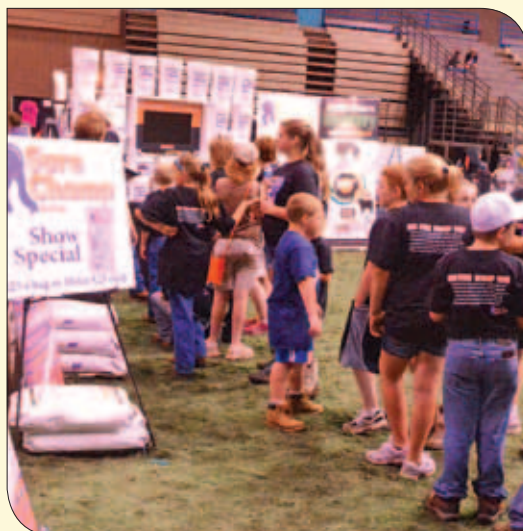
The VitaFerm Sure Champ booth was a popular attraction during the week, as youth spun the Sure Champ game wheel each day for prizes.