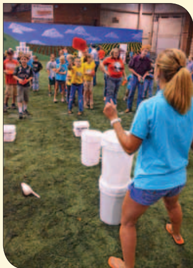
JNHE attendees enjoyed various games and activities all week at the ringside VitaFerm Sure Champ booth. During the opening ceremonies barbeque, youth tested their skills by tossing feed scoops into varying heights of feed buckets.