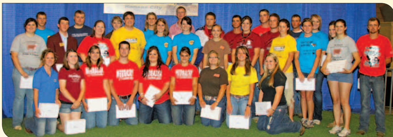
Forty junior Hereford exhibitors were recognized as "retiring" members exhibiting at their last JNHE.