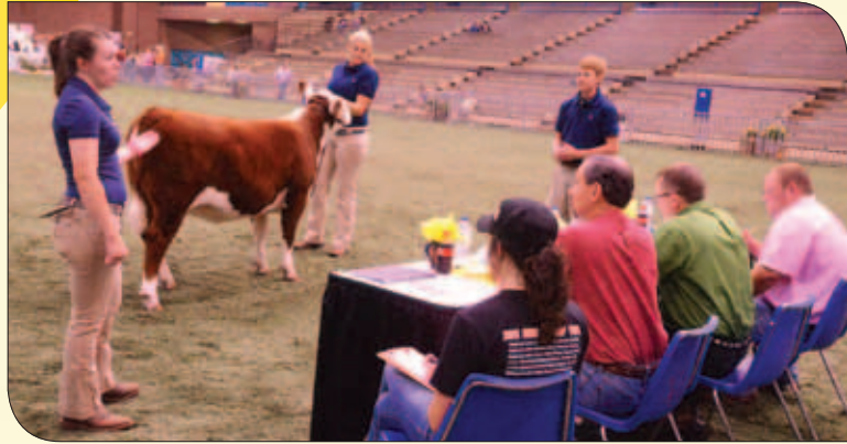
Members of the Georgia senior team marketing team worked to persuade the judges to purchase their heifer during the team marketing competition in Hale Arena. Seven junior teams and eight senior teams competed.

Many youth donned their VitaFerm Sure Champ t-shirts during the JNHE judging contest on Tuesday, which was proclaimed VitaFerm Sure Champ Day.