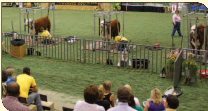
Wednesday afternoon the top 10 senior showmanship finalists demonstrated their fitting techniques prior to the selection of the champion showman.