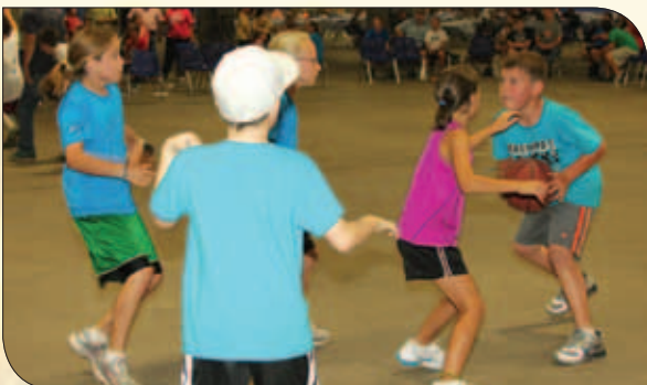
A highlight of the week, 79 teams competed on Monday afternoon for the 3-on-3 basketball championship titles in four age divisions. Pictured here are the Kansas and Texas peewees battling it out in the championship game.