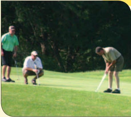
Forty-two golfers participated in the Hereford Youth Foundation of America golf tournament at Paradise Pointe near Smithville, Mo.