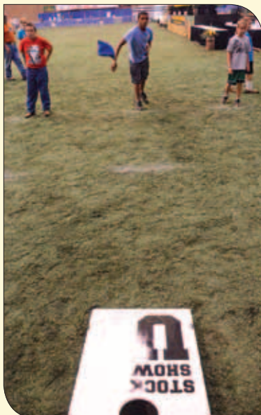
Stock Show U provided friendly cornhole competition during the opening ceremonies barbeque on Monday evening.