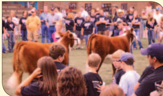
More than 450 participants tested their judging skills during the JNHE judging contest in Hale Arena.