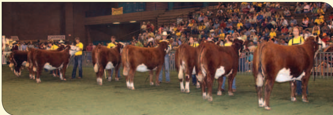
A total of 13 division winners vied for champion owned polled female honors.