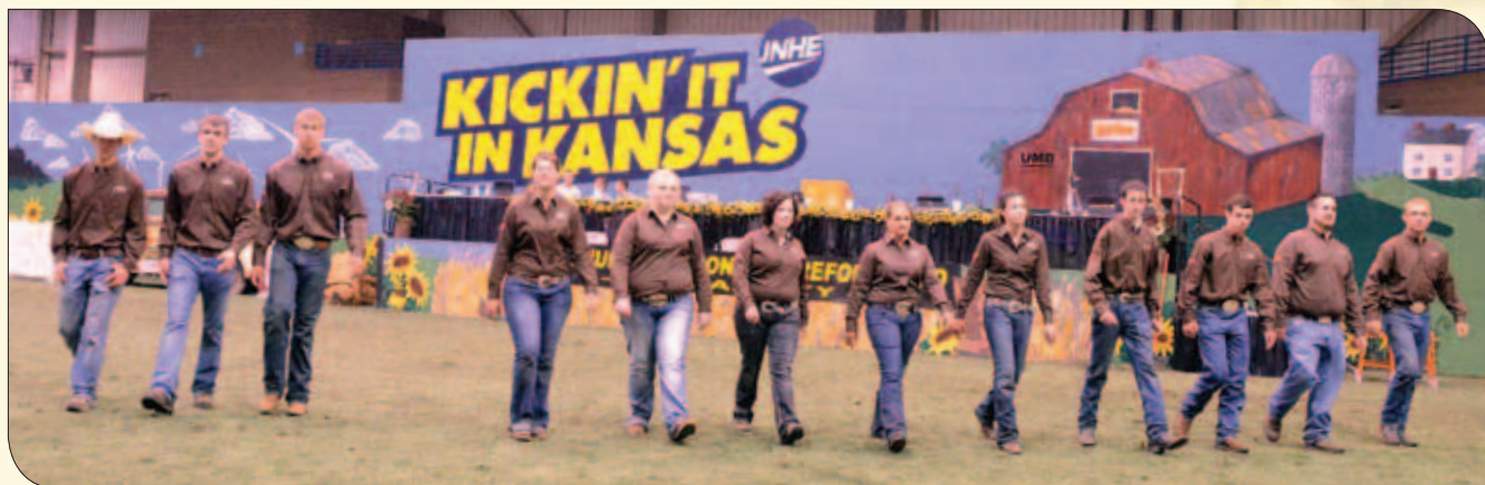
Throughout the week the 12 NJHA directors helped in the ring and facilitated contests.